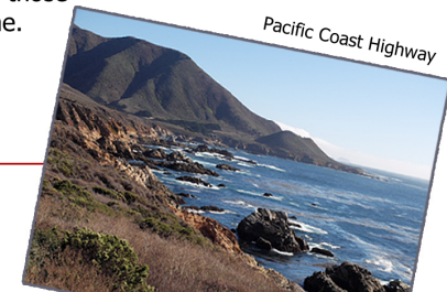
Pacific Coast Highway