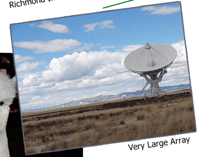
Very Large Array