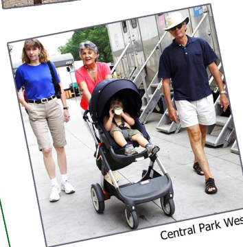
Central Park West