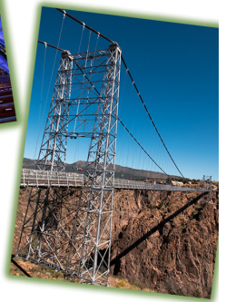
Colorado, September, awesome.