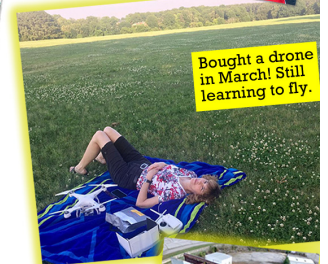
Bought a drone in March! Still learning to fly.