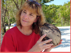
What is that nut saying now?