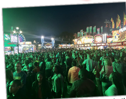
One of our favorite fall events is the State Fair. This was the crowd on a Saturday night. Just a few people...