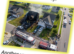
Another year of chasing fire engines, including the city's largest blaze in 100 years. Or maybe more. Let's ask the historian. Wait, that's me!