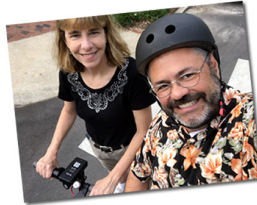
Rode the new rental scooters