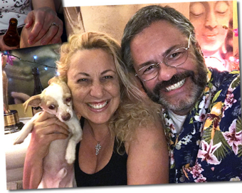
Lots of family fun!