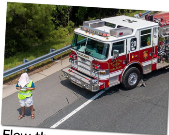
Flew the drone...