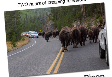
Jammed with some Bison...