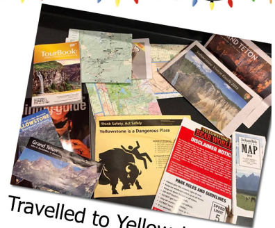
Travelled to Yellowstone...