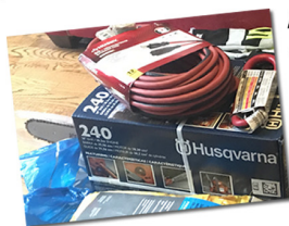
Even bought a chain saw and (small) generator! Which we didn't need...