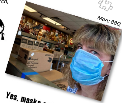
Yes, masks are no fun.