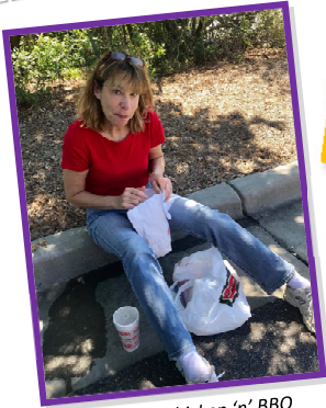
Smithfield Chicken 'n' BBQ