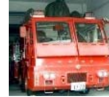
The Real Thing

1979 Fuso armored foam pumper, Sakai Fire Department, Takaishi station. Equipped with Morita ME-7A pump, carries 1300 liters of foam and 230 kilograms of dry powder. Stationed near factory with explosive hazards. Majority of apparatus is covered. Dry powder turret on roof, plus nozzles over windshield and below bumper. Also equipped with dry-powder hose reel. Nitrogen gas propellant and dry-powder containers stored in rear section. Mid-mounted turret is remote controlled combination water cannon and dry-powder nozzle. Turret mechanisms protected by metal dome. Both pump and nozzle can also be operated away from apparatus, using direct-wire remote control.