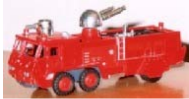
Hand-Painted By Yours Truly