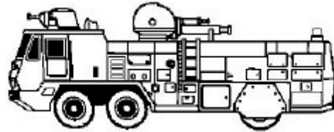
Drawing From Model Box