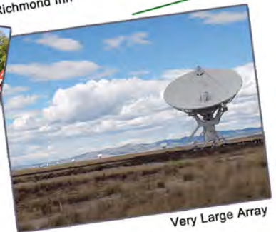
Very Large Array