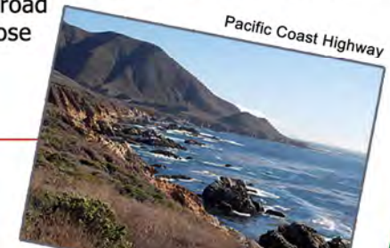
Pacific Coast Highway