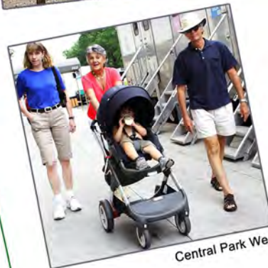
Central Park West