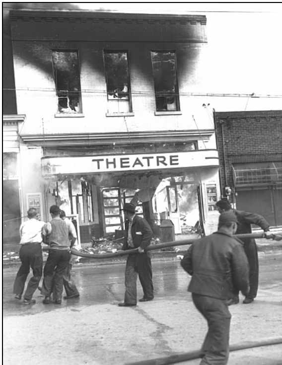
Fuquay Springs, 1946