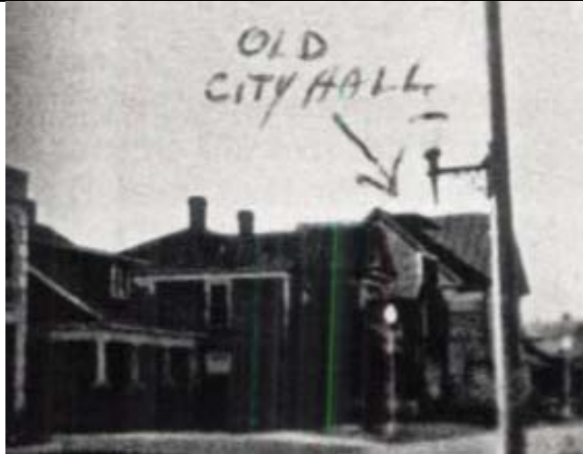
Pictorial History of Morehead City photo