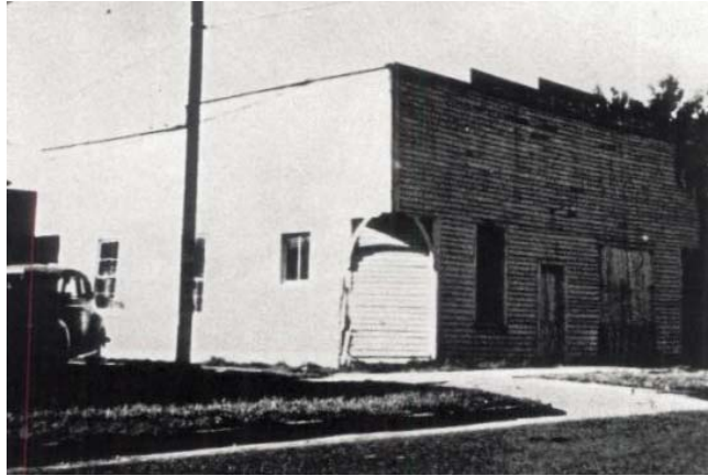
Pictorial History of Morehead City photo