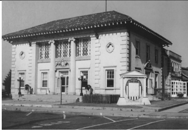
Pictorial History of Morehead City photo