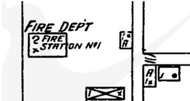
Pictorial History of Morehead City photo