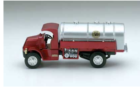
1923 Mack AC