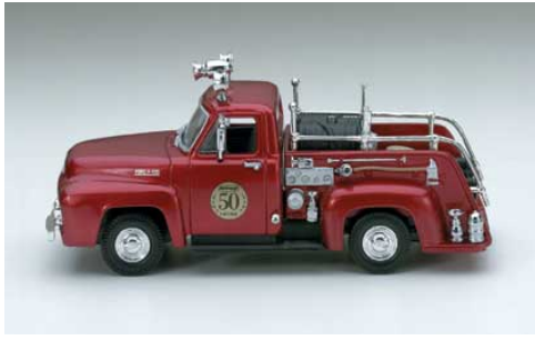
1953 Ford F-100