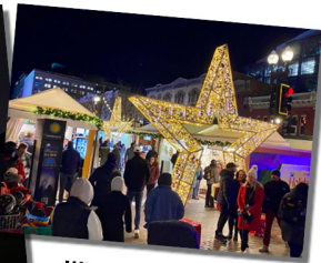
Winter market Washington, DC