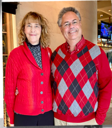
Christmas Eve Church Service